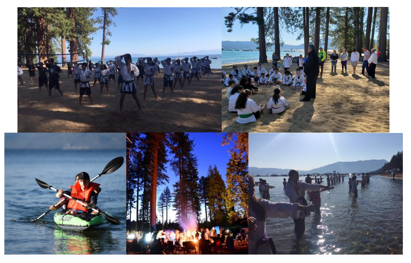
Date of Camping at Camp Richardson Lake Tahoe Arrive June 15 - Depart June 19, 2022