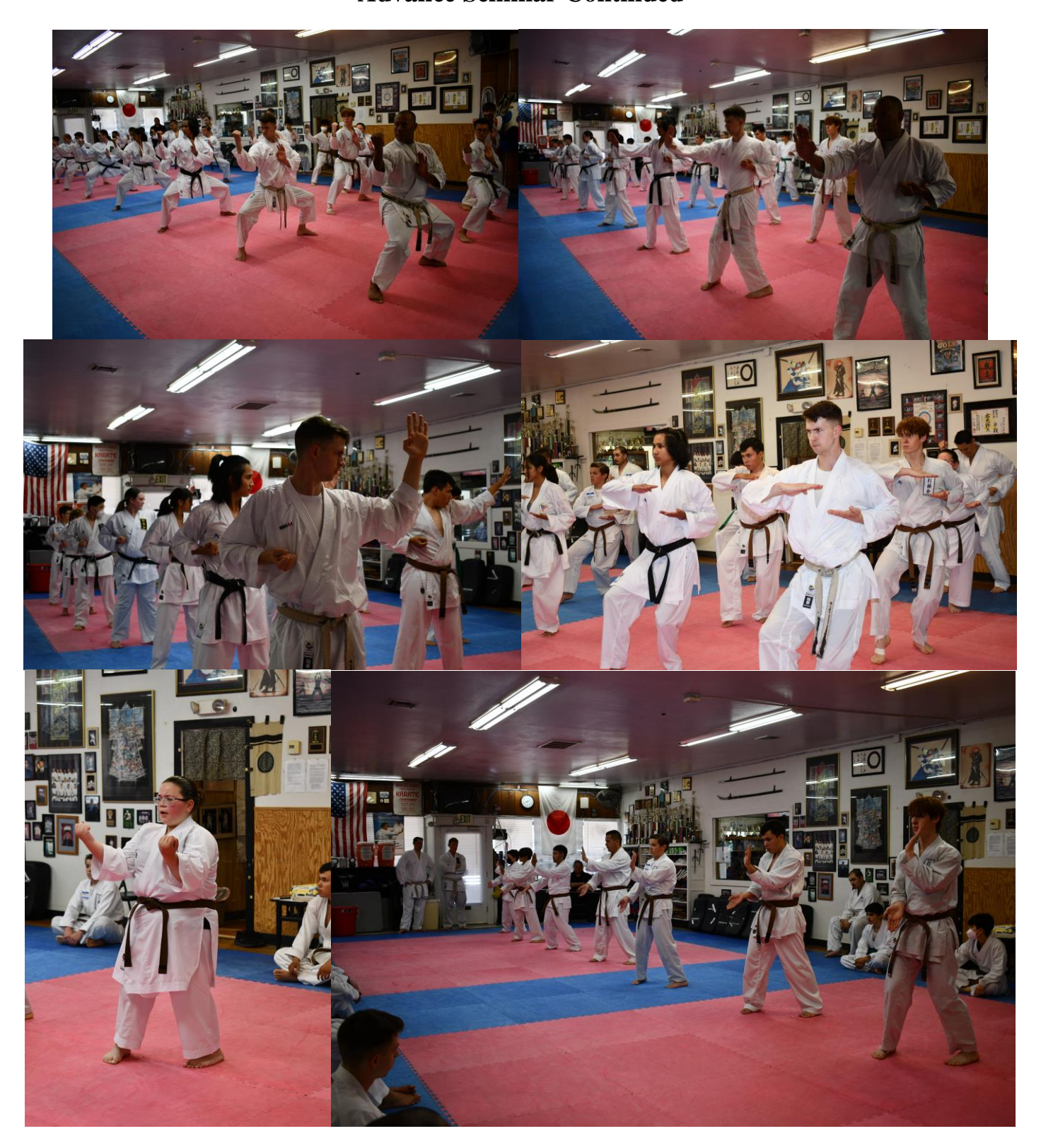
So Proud of the quality you have all developed in to in Goju Ryu Karate. The students have worked years to achieve this level of development.