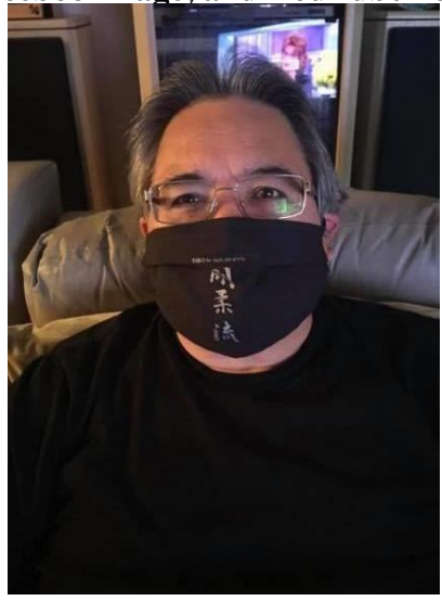
New Tibon's Goju Ryu Face Mask will be provided to our instructor staff employees.

Many parents and students have requested to purchase. These are hand custom made and sent in for Japanese Kanji Screening. They take awhile but are worth the wait. They are $15 a piece and going fast I have already taken orders for 60 masks just in one day that are ear marked for those orders. They are hand washable in warm water 3 ply cotton mask. If you are interested and have not already place an order with me, please contact me so I can setup a 3<sup>rd</sup> order.