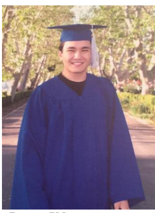
Creek HS Graduate going to University of the Pacific Mechanical Engineering 1st Degree Black Belt