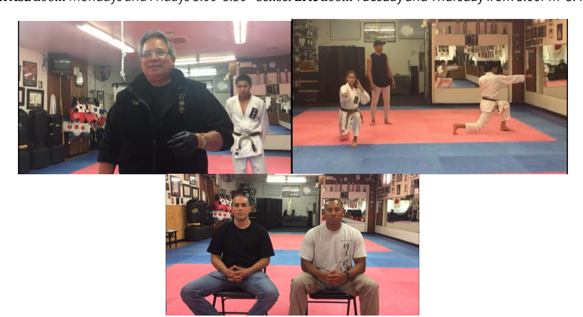
These are the different Virtual Karate Class Videos on Facebook and YouTube Access