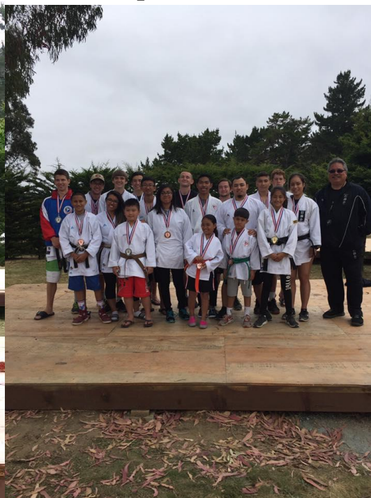
Tibon's Karate Athletes for Training and Fitness Challenge for Awards