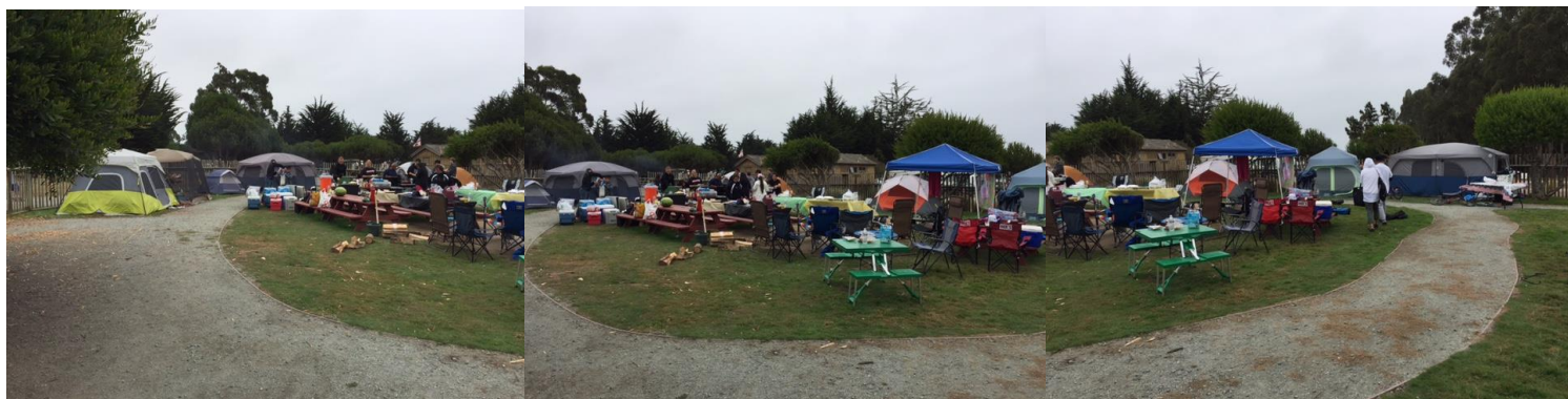
Private Fenced Camping Area for our Karate Group