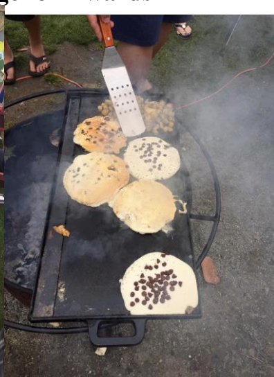
Great Morning Breakfast Cooked by our Karate Parents