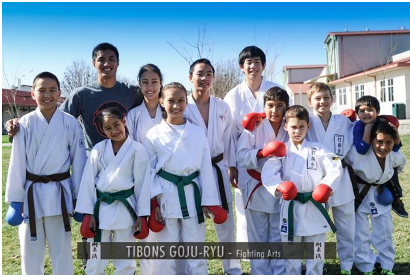
Some of our Tokubetsu Competitors at the Shotokan Tournament in Yuba City taking 13 medals