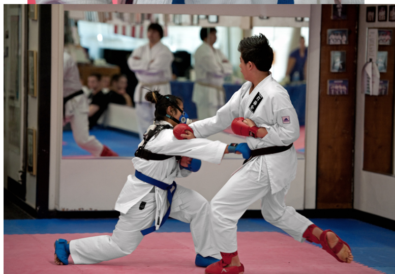
Tibon's Goju Ryu Elite Athletes Participate in National Test Thesis-Physiological Metabolic Demands Elite Karate Competitors